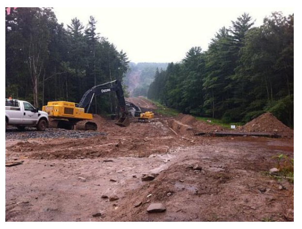
Figure 6: Picture of a natural gas pipeline construction in Pike County, Pennsylvania.

Additionally the air quality impacts associated with methane leakage, the stormwater runoff and loss of groundwater recharge associated with vegetation loss and soil compaction, the impacts of forest fragmentation and invasive species are also enduring.