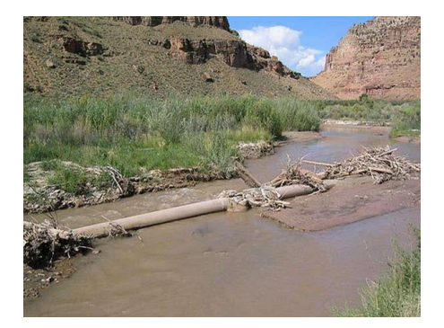
Figure 4: Picture of an exposed pipeline crossing an unnamed western US river.

the catastrophic discharge of its contents into the natural stream system. Talke and Swart (2006) and De La Motte (2004) discuss gas pipelines and how man-made changes and actions have altered channel morphology and changed channel stability. Soil erosion and channel migration reduces the soil cover over a pipeline, resulting in scour hole formation and making the pipeline vulnerable to rupture. Lateral migration of stream channels can also heighten the risk of pipeline exposure. Fogg and Hadley (2007) evaluated hydraulic considerations for pipeline crossings stream channels. Their Figure 4 depicts lateral migration of a stream channel during high water that excavated a section of pipeline under the floodplain that was several feet shallower than at the original stream crossing.