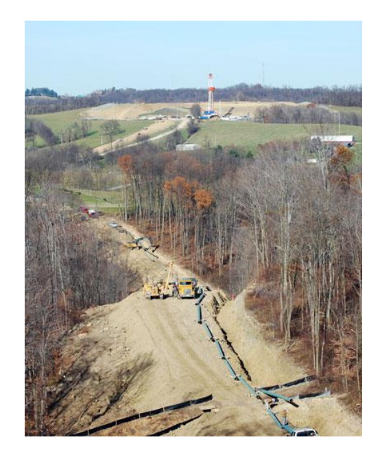
Figure 2: Picture of a well-pad and gathering line located in Amwel Township, Pennsylvania

In addition to the pipelines themselves, compressor stations need to be constructed every 30 to 60 miles in order to boost pressure in the line as it is lost to friction. These compressor stations are usually comprised of multiple engines, generating thousands of