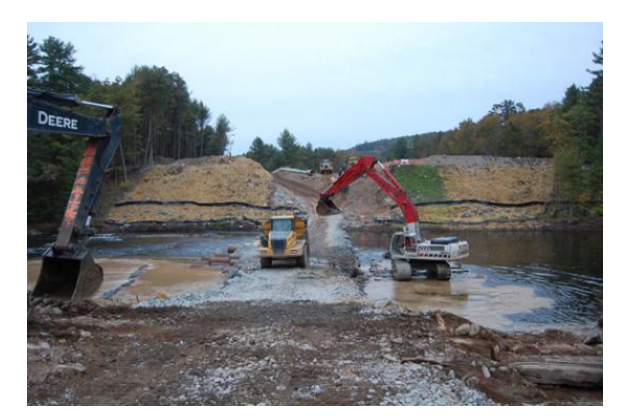
Figure 3: Picture of wet ditch crossing of the Lackawaxan West Branch River .

<u>Wet ditch crossing</u> construction is primarily accomplished through in-stream dredging. While this method is cheaper, quicker, and thus more common, it is also associated with more significant environmental problems than any of the dry ditch techniques. The process for wet ditch crossings involves laying pipe across a stream by digging a ditch from one side of the stream to the other. In some cases, a temporary bridge is installed so the backhoe can dig a trench across the streambed (see Figure 3^{11} ).<sup>12</sup> This construction occurs as the stream is flowing ; there is no redirecting or damming of water. There are high releases of sediment, impacts to aquatic ecosystems, and changes in channel morphology.<sup>13</sup>